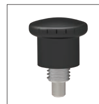
Thin wall mount