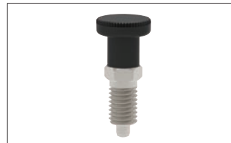
Stainless with plastic grip