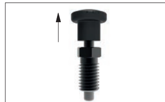
Non locking (spring back)