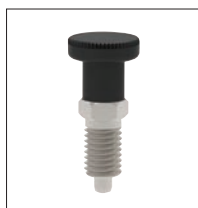
Fine threaded (standard)