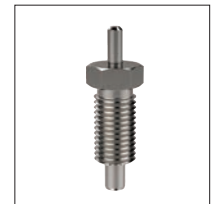
Threaded for bespoke handle