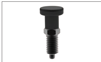
Steel with plastic grip