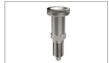
Stainless body and grip