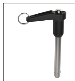
Single acting Pip-pin, standard LA handle