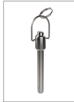
33630 - Single acting Pip-pin, standard R handle