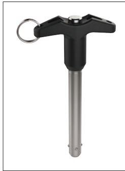
33610 - Single acting Pip-pin, standard TA handle