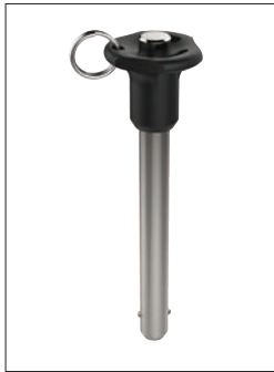
33600 - Single acting Pip-pin, standard B handle

With many years experience producing an extensive range of standard Pip-pins (also know as quick release pins or ball lock pins) we are now able to offer of Aviation Standard approved Pip-pins, manufactured according to NASM norms (formerly MS norms) and tested to NAS 1332 standards.