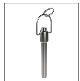
Single acting Pip-pin, standard R handle