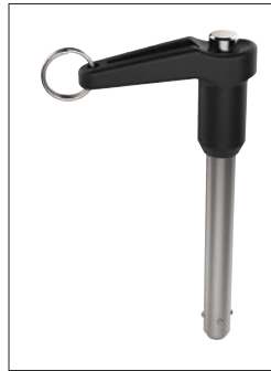
33620 - Single acting Pip-pin, standard LA handle