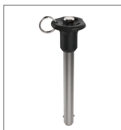
Single acting Pip-pin, standard B handle