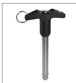
Single acting Pip-pin, standard TA handle