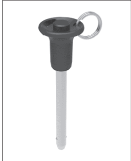
33600 - Single acting Pip-pin, standard B handle

With many years experience producing an extensive range of standard Pip-pins (also know as quick release pins or ball lock pins) we are now able to offer of Aviation Standard approved Pip-pins, manufactured according to NASM norms (formerly MS norms) and tested to NAS 1332 standards.