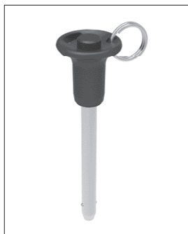
Single acting Pip-pin, standard B handle