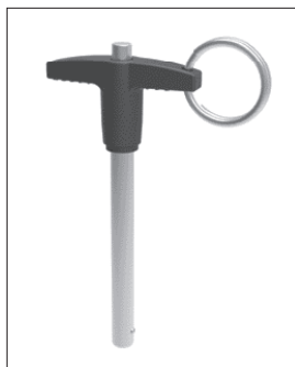
Single acting Pip-pin, standard TA handle