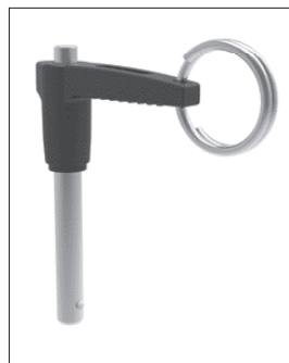
Single acting Pip-pin, standard LA handle