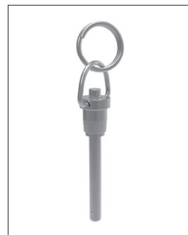
Single acting Pip-pin, standard R handle