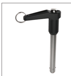
Single acting Pip-pin, standard LA handle