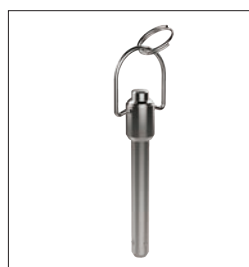
Single acting Pip-pin, standard R handle