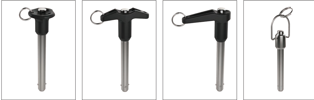
33600 - Single acting Pip-pin, standard B handle

With many years experience producing an extensive range of standard Pip-pins (also know as quick release pins or ball lock pins) we are now able to offer of Aviation Standard approved Pip-pins, manufactured according to NASM norms (formerly MS norms) and tested to NAS 1332 standards.