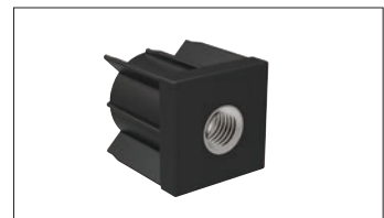
Hollow section bushed insert