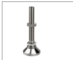
Articulating levelling feet