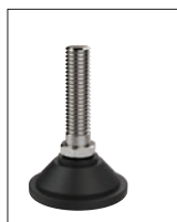
Standard nylon base