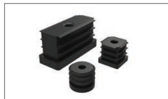
Hollow section insert