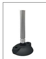
Bolt down base