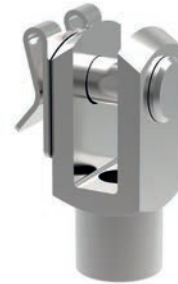
Clevis with clevis pin 65664 Safety fastener 65680