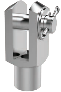
Clevis with clevis pin, washer and cotter pin 65660 and 65674