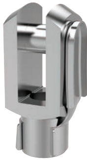
Clevis with retention clip 65630 and 65684