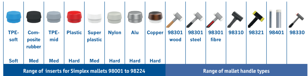
Application selection chart