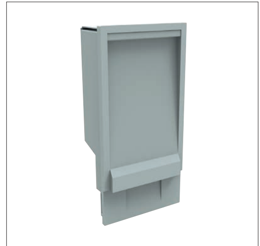
Cam Latch - Concealed T-Handle for electricity panels