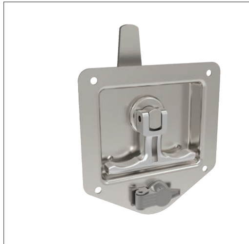
Cam Latch - Flush T-Handle with adjustable grip