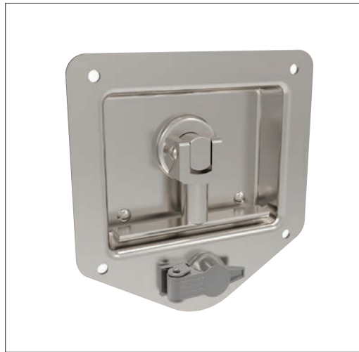
Cam Latch - Flush T-Handle with rod control for multi-point latching