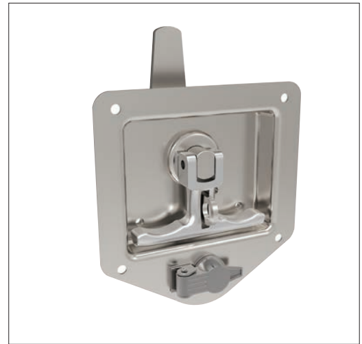
Cam Latch - Flush T-Handle for single point latching